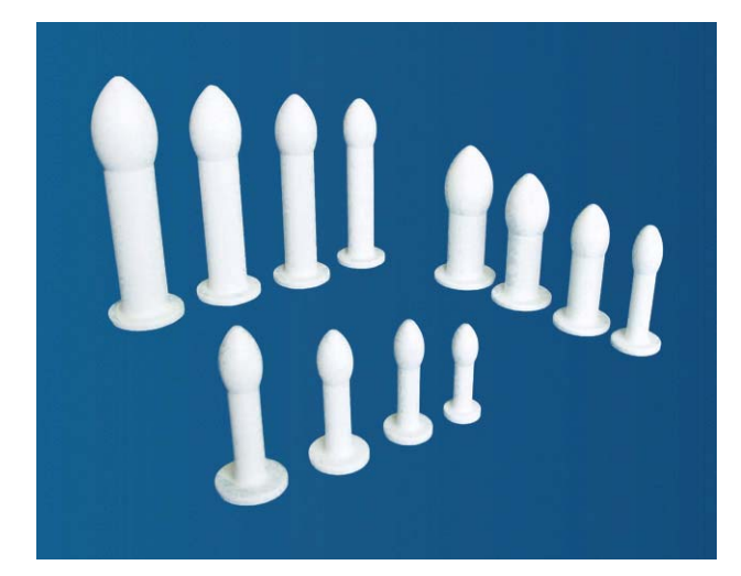
Vaginal Dilator Sets, Model: Family A -Large, Family B -Medium. Family C-Small